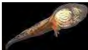
Tadpole with two back legs.

Metea volunteers needed to develop volunteer events at Metea.