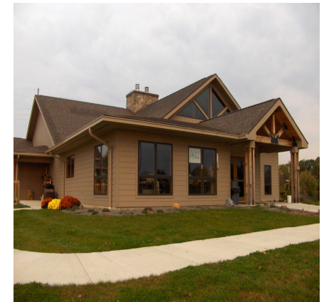
Metea County Park Nature Center

Fox Island County Park Phone: (260) 449-3180 Metea County Park Phone: (260) 449-3777