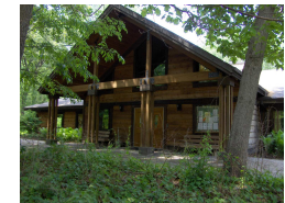
Exterior front view of the Nature Center. The entry hall has topographical maps, arrowhead display, tree house for the kids, live animal displays and a fireplace with seating. There is a full deck on the back of the building.

2 Both classrooms required for Saturday night rentals