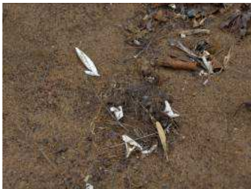
Turtle egg shells

Watch out for frogs and turtles on the roads—especially during rain!!!