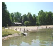
Bowman Lake at Fox Island County Park

Allen County Parks are owned by the people of Allen County and operated by the volunteer Allen County Parks and Recreation Board, appointed by area public and elected officials.