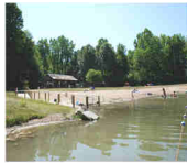
Bowman Lake at Fox Island County Park

Allen County Parks are owned by the people of Allen County and operated by the volunteer Allen County Parks and Recreation Board, appointed by area public and elected officials.